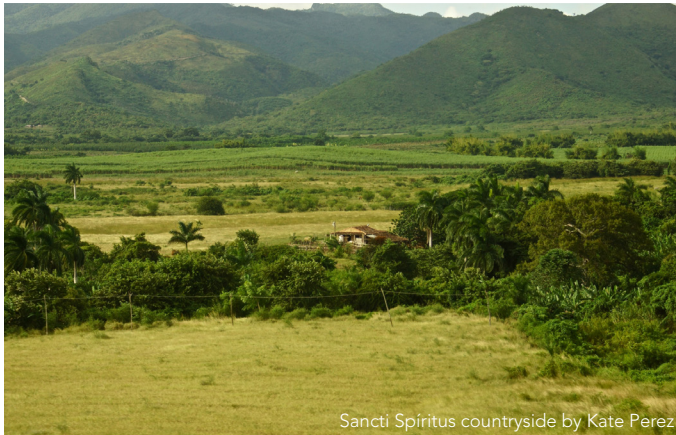
Sancti Spiritus countryside

After breakfast, check out of your hotel and begin your journey to Holguín. En route, stop in Mangos de Baraguá and learn about the town's role in Cuba's independence from Spain. Also stop in the village of Mella for a visit to the Bayate Group, a community folk art project. Have lunch, and then continue on to see the birthplace of Fidel Castro in Birán. Dinner will be at a paladar in Holguín. Overnight at Hotel Caballeriza. (BLD)