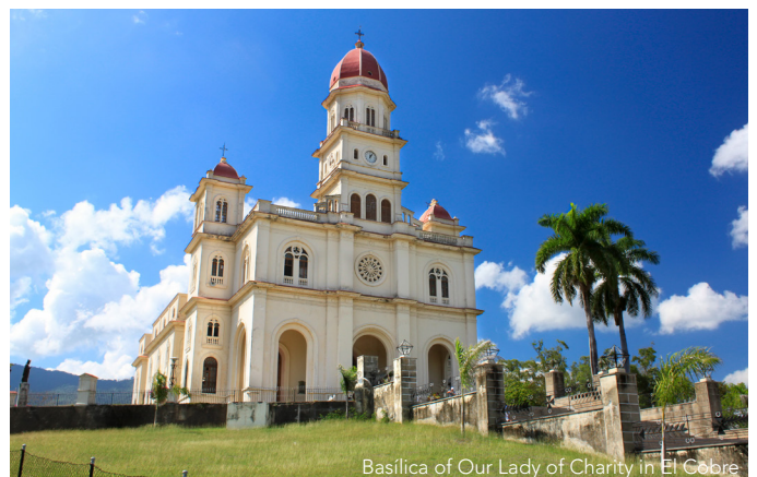
Basílica of Our Lady of Charity in El Cobre

Today starts with a visit to the Jardín de los Helechos, a garden known for its collection of ferns and orchids. Afterward, travel to the nearby town of El Cobre and see the Basílica of Our Lady of Charity and the Monumento al Cimarrón, a 20-foot sculpture by Alberto Lescaj that commemorates an important 18th century slave rebellion. After lunch at a paladar in El Cobre, return to Santiago de Cuba. Visit Santa Ifigenia Cemetery, where several notable figures of Cuban history are laid to rest, before continuing to General Antonio Maceo Square. Maceo, nicknamed the "Bronze Titan," played a critical role in Cuba's fight for independence from Spain; today, the square's bronze statue (also by Lescaj) is the largest in Cuba. After dinner at a local paladar, take in Céspedes Park and La Iris Jazz Club. Overnight at Iberostar Imperial. (BLD)