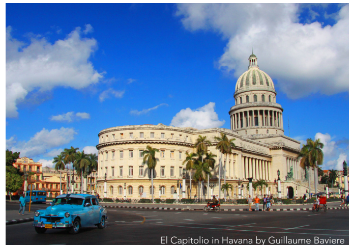
El Capitolio in Havana

This morning you will be transferred to the Havana International Airport for your flight(s) home. (B)