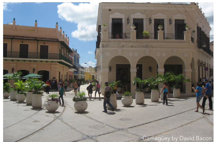
Camagüey by David Bacon

Cost is based on double occupancy; for a single room throughout the trip add $520 per person. A $200 per person deposit and enrollment form are required to reserve your space on the trip. This deposit is refundable excluding a $100 cancellation fee until August 30, 2019, at which time non-refundable final payment is due.